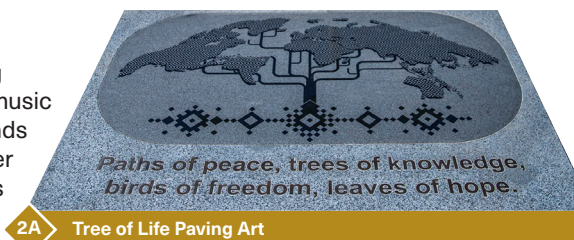
2A Tree of Life Paving Art

As a focal point at this end of the avenue, a specimen tree has been planted to represent the 'World Tree', the 'Tree of Life', and a Buddhist quote given during the engagement process, 'We are leaves on one tree'. A Sweet Chestnut tree was chosen – which grows all over the world. Associated creative writing on the floor at the base of the tree says, 'Paths of peace, trees of knowledge, birds of freedom, leaves of hope' which was one community member's reflection of what Princes Boulevard means to them.