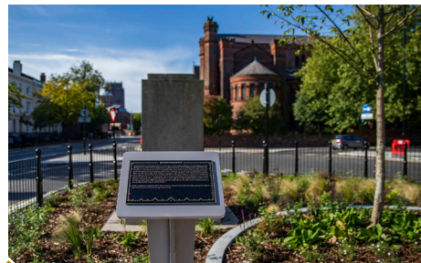
1A Huskisson Plinth

The Huskisson plinth, which once celebrated the Victorian MP William Huskisson. It has been empty since 1982. The reasons for this have been acknowledged with a new inscription acknowledging his role in the slave trade.