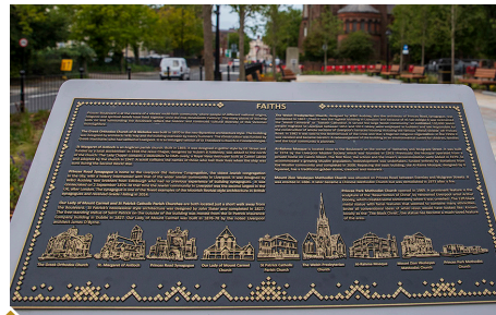
1B Faiths Interpretation Panel

Princes Boulevard is at the centre of a vibrant multi-faith community where people of different national origins, religions and spiritual beliefs have lived together since the mid-Nineteenth Century. The many places of worship both on and surrounding the Boulevard reflect the historic and continued cultural diversity of this Victorian thoroughfare. These are highlighted on the interpretation panel.